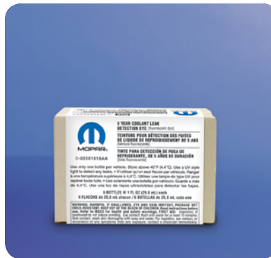
5-YEAR COOLANT LEAK DETECTION DYE 5-Year Coolant Leak Detection Dye is used in Mopar 5-Year/160,000 Km Antifreeze (Part No. 05066386AA). Dilution ratio of 29.6 mL to 3.78 L of antifreeze. 29.6 mL Bottle MSQ: 6 Bottles Part No. 05161618AA

Simple-to-use dye identifies leaks. Fluorescent dye leak detecting compounds make short work of pinpointing difficult-to-diagnose leaks by glowing brightly when exposed to ultraviolet (UV) light. Convenient, single-application bottles.