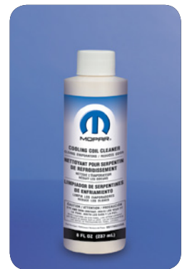
COOLING COIL CLEANER Heavy-duty, fast-acting cleaner. Removes dirt and odor-causing organic matter. Biodegradable, safe on automotive surfaces. 236 mL Bottle MSQ: 12 Bottles Part No. 05170022AA

Note: The photos shown on this page may not be representative of actual product.