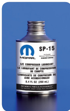
SP-15 A/C COMPRESSOR LUBRICANT 250 mL Can MSQ: 1 Can Part No. 04886129AA