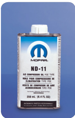
ND-11 A/C COMPRESSOR OIL POE TYPE Formulated for use only in electrically driven compressors. 250 mL Can MSQ: 1 Can Part No. 68043289AA