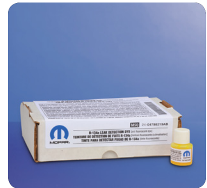
R-134a LEAK DETECTION DYE 7.39 mL Bottles MSQ: 24 Bottles Part No. 04798219AB