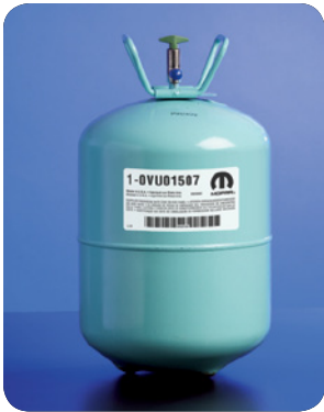
R-134A A/C REFRIGERANT Convenient 30 lb. non-returnable container. 13.6 Kilogram Cylinder MSQ: 1 Cylinder Part No. 0VU01507AB