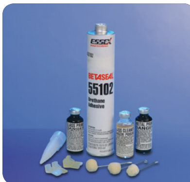
WINDSHIELD INSTALL PACKAGE Contains: Tube Urethane Adhesive (310 mL), Metal Primer (33 mL), Glass Primer (33 mL), Application Dauber (1), Foam Spacers (10), and Windshield Supports (2). MSQ: 1 Part No. 04864015AC