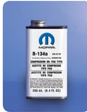
R-134a COMPRESSOR OIL PAG TYPE 250 mL Can MSQ: 1 Can Part No. 82300102AB