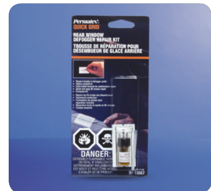
REAR WINDOW DEFOGGER REPAIR KIT • Repairs scratched or broken rear window defogger/defroster grid lines • Quick and easy 10-minute repair • High electrical conductivity • Dries to a colour that matches the heating element Applications: To repair scratched or broken rear window defogger/defroster grid lines. 1.4 mL Kit MSQ: 1 Kit Part No. 0VU01331

Note: The photos shown on this page may not be representative of actual product.