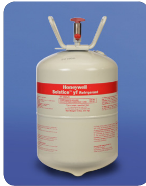
SOLSTICE R-1234YF A/C REFRIGERANT New air conditioning refrigerant for use in vehicles equipped with the 1234YF systems. 4.5 Kilogram Cylinder MSQ: 1 Part No. 68224028CA