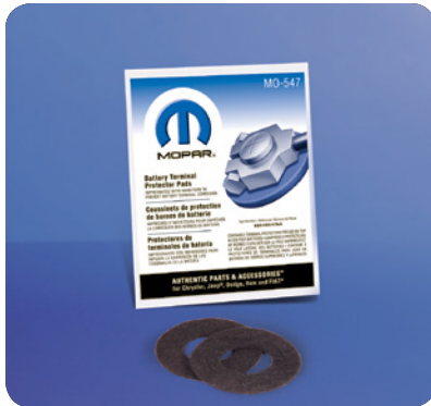
BATTERY TERMINAL PROTECTOR PADS 2 Pads MSQ: 25 Pouches Part No. 68048547AA