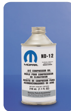
ND-12 COMPRESSOR OIL Formulated for use in automotive air conditioning systems using R-1234yf refrigerants. 210 mL Can MSQ: 1 Can Part No. 68224150AA