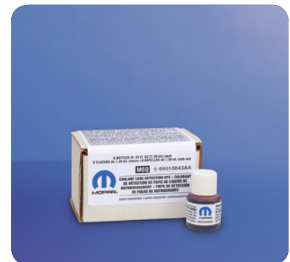
COOLANT LEAK DETECTION DYE 7.39 mL Bottles MSQ: 6 Bottles Part No. 05010043AA