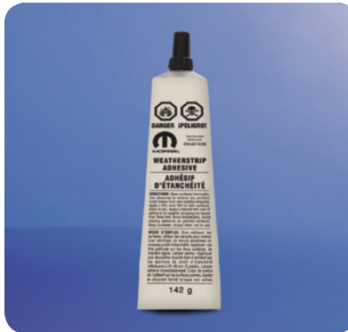
WEATHERSTRIP ADHESIVE Adheres weatherstripping to painted metals for a permanent bond. Withstands heat and freezing conditions; also resists gasoline, kerosene, antifreeze and most solvents. 142 G Tube MSQ: 10 Tubes Part No. 04773774