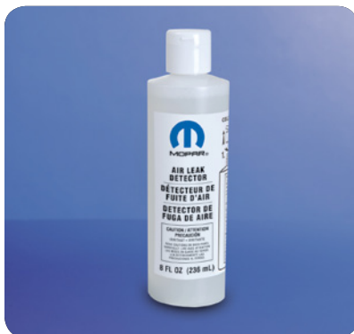
AIR LEAK DETECTOR 236 mL Bottle MSQ: 1 Bottle Part No. 05191804AA