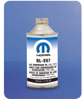
RL-897 A/C COMPRESSOR OIL PAG TYPE Formulated for use only in electrically driven compressors. Do not mix with other PAG type compressor lubricants. 210 mL Can MSQ: 1 Can Part No. 68170681AA