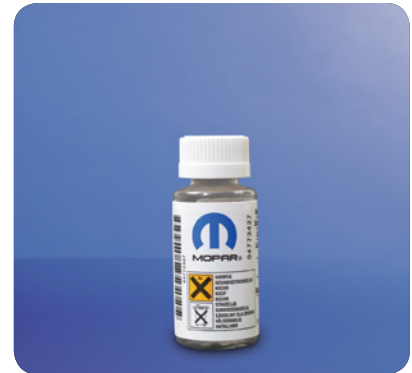
WEATHERSTRIP LUBRICANT Unique Krytox (synthetic fluorinated lubricant) formulation lubricates weatherstripping to prevent it from sticking to door glass and frames. Clear fluid provides long-lasting lubrication. Will not stain or mar clothing. Features built-in sponge applicator. 30 mL Bottle MSQ: 1 Bottle Part No. 04773427