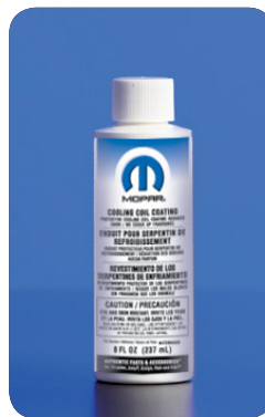
COOLING COIL COATING Provides a durable coating to the air conditioning evaporator to reduce or eliminate odors. 236 mL Bottle MSQ: 6 Bottles Part No. 04728942AB