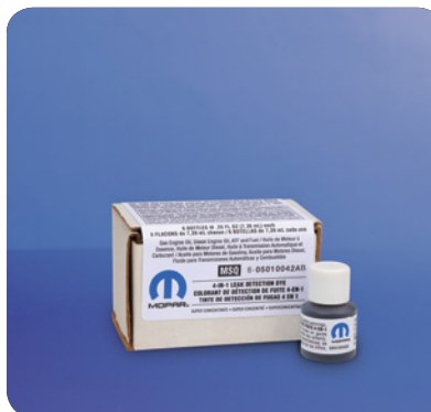
4-IN-1 LEAK DETECTION DYE 4-in-1 Leak Detection Dye can be used in engine oil (7.39 mL dye per 3.78 L of oil), ATF (7.39 mL dye per 5.68 liter of ATF), fuel (7.39 mL dye per 7.57 L of fuel), and power steering fluid. (NOTE: For finding power steering leaks only use 1/4 of total amount of dye in the 4-in-1 7.39 mL dye bottle). 7.39 mL Bottles MSQ: 6 Bottles Part No. 05010042AB