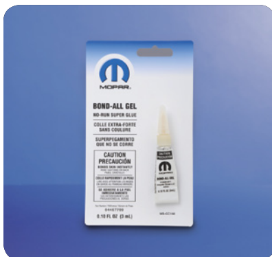
BOND-ALL GEL Super adhesive glue instantly bonds a wide variety of materials. Thick, no-run glue for use on weather stripping, bumper rub strips, body side moldings and many other items where permanent repair is needed. 3 mL Tube MSQ: 10 Tubes Part No. 04467709